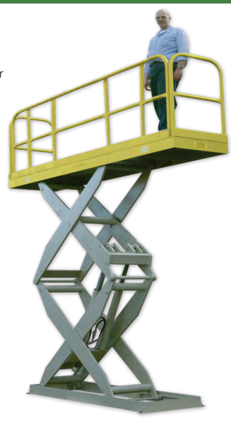
LSH Series Modified use as Personnel Lift