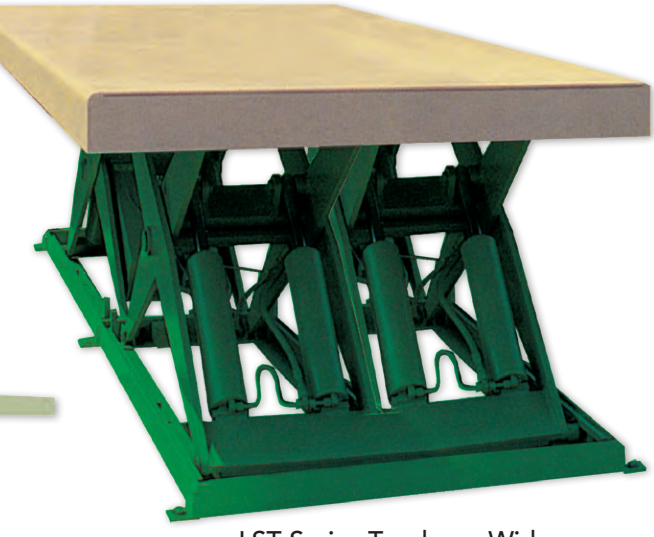
LST Series Tandem - Wide

Tandem design allows the combination of high capacity and low collapsed height to support loads up to 7' x 17'. They are available in extra long and extra wide configurations.