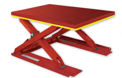
LiftMat Low-Profile Lift