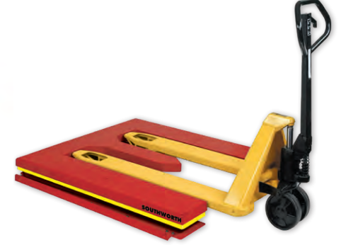
Roll-In Palletizing Lift