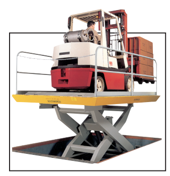
H - Series dock lift for heavy loads (over 10,000 lbs.) and/or forklift accessibility.

Southworth offers seven standard dock lift models with capacities from 5,000 to 20,000 lbs., platform sizes up to 8' x 12' and a variety of installation configurations to accommodate any loading dock requirement. Models featuring an "M" designation are built for use with two wheel dollies, hand carts, and hand pallet trucks. "H" model designations can be used with powered devices like powered pallet trucks, counterbalanced stackers and fork lift trucks.