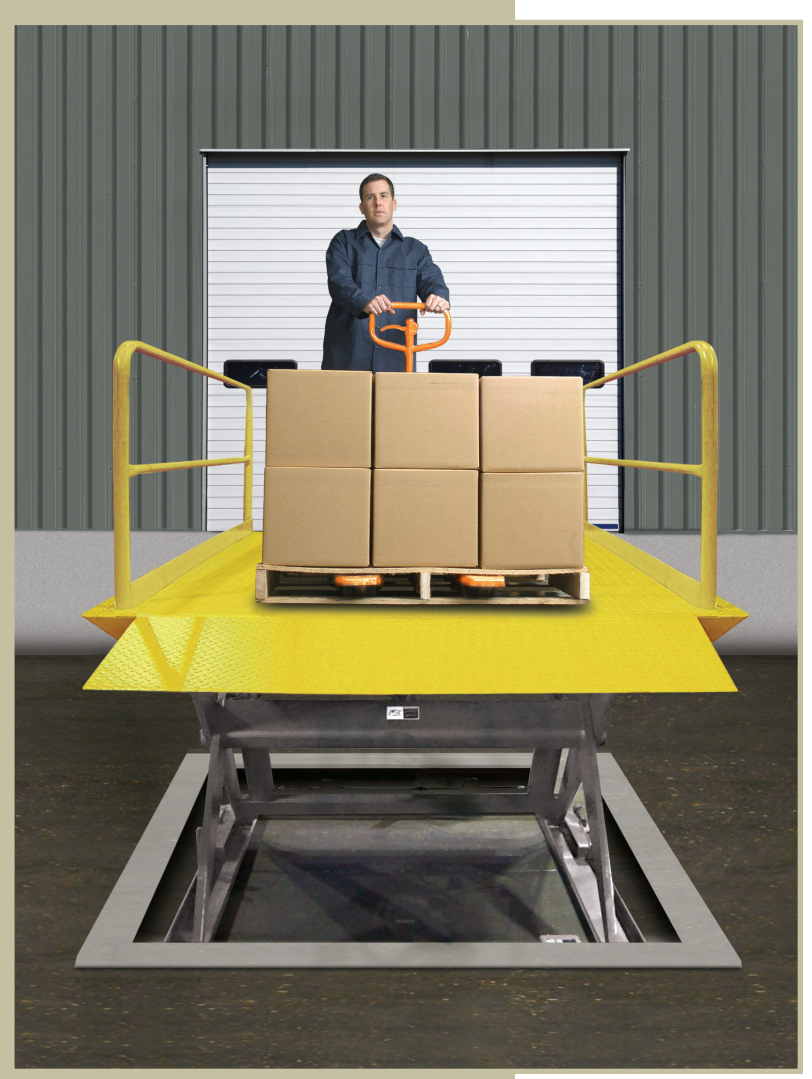
M - Series dock lift featuring Dura-Dock<sup>™</sup> weatherproof construction.